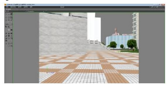
FIGURE 2 LOD Display

visual effects and computer processing speed, you need to use certain technology to manage model in the scene, this paper adopts the model level of detail processing technology, namely LOD technology, to achieve optimization of the complex three-dimensional model of Fuzhou city. When scenes is displayed dynamically, we selected the model according to the screen pixel two kinds of judgment, namely according to the number of pixels of image of an object on the screen to select occupied model. In the premise of ensuring the real-time dynamic display, we dynamically determined threshold and selection model, in order to obtain higher image quality. In Virtools using progressive mesh algorithm, which has progressive mesh data structure requirements, the effect of the observed scene in 500 meters and the effect of the observed the scene in 500 - 800 meters were compared, when the mouse is moved closer. Scene recall geometric texture modeling scene, the browsing speed is not affected, the 3D scene after adjusting LOD is shown in Figure 2 below: