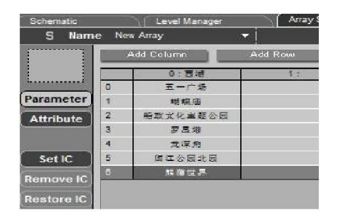
FIGURE 5 Database and Roaming Path Design

kinds, it is respectively Ineger (integer), Float (float), String (string), Object (object), Parameter (parameters), system memory is the scenic spot information, which is mostly text, so string is chosen, a good set of parameters, in this way, to establish the database, store information. Once the database is established, information extraction needs to create a script, using BB Get Row to extract data. You should add to the appropriate number of BB Text Display with a BB Set Texture to display information basing on the number of data. As shown in Figure 5.