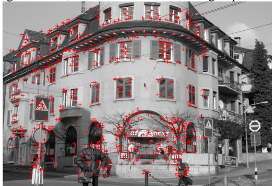
(a)SIFT feature extraction

eradicated in the second image feature. 23% edge points are averagely removed. These edge points are the wrong results which are generated when the image is affected by the noise, the feature point extracted by the algorithm of this work greatly enhances the robustness of the SIFT algorithm. The experimental results of 5 images are presented in the following Table 1.