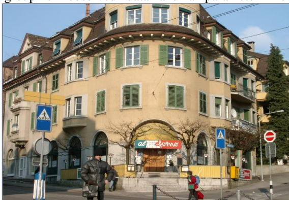
(a)Original reference image

This work adopts RANSAC to cancel the wrong matching. The input of the RANSAC algorithm contains a group of observed data and a parameter model