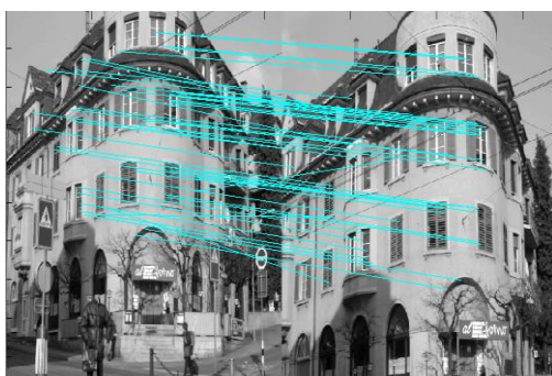
Original SIFT feature matching result

matching points of the first group is 70, the matching points of the second group 51, the matching points of the third group 29, the matching points of the fourth group 83, the matching points of the fifth group 50, and finally the matching points 283, which is 4 times of the previous algorithm. The experimental result is shown as the following figures.