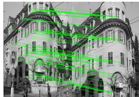
Matching result of the 1 st group in the algorithm of this paper