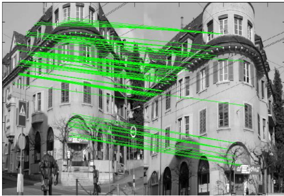
Matching result of the 4 th group in the algorithm of this paper