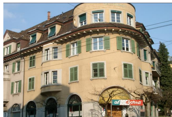
(b)Original image without rectification

(1) In the feature extraction phase, several experiments and data indicate, the feature extracted by the SIFT algorithm after being optimized by the Canny algorithm is more stable than the original SIFT feature, which meanwhile provides good basis for the later matching. 30 pairs of images are selected in the experiment; each pair is captured from different angles, the images of the same scene with different scaling, different rotation angles and view change are used as the required data of the experiment. Limited by the length of this work, one group of images will be mainly analysed in image 1; the size of the image is 640*480. The two images of this group are marked by the original reference image and the original image without rectification, respectively.