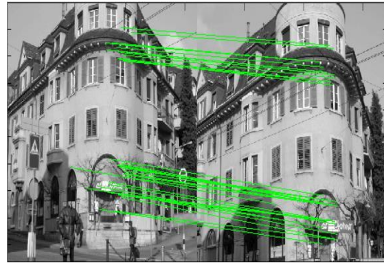
Matching result of the 5 th group in the algorithm of this paper